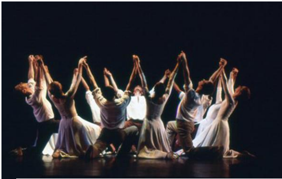
José Limón's There is a Time

In 1946, Mexican-born choreographer José Limón formed his own dance company with Doris Humphrey as artistic director. On January 5, 1947, the Company had its debut performance. In celebration of concurrent anniversaries and birthdays, the Limón Dance Company offers several major revivals and a newly commissioned work to stand alongside the classic works of José Limón and fellow pioneers of modern dance. Special projects include: